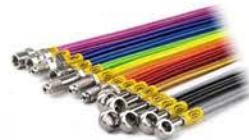
HEL flexible braided clutch line Part No. CCK172