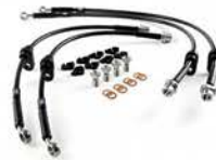
HEL braided brake lines Part No. TOY-4-151