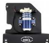
HEL rear differential oil cooler kit Part No. GRDIFF