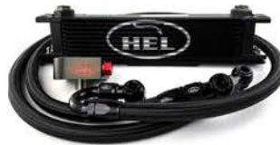
HEL oil cooler kit Part No. HOCK-TOY-005